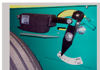
Electro hydraulic cylinder for adjusting flow rate