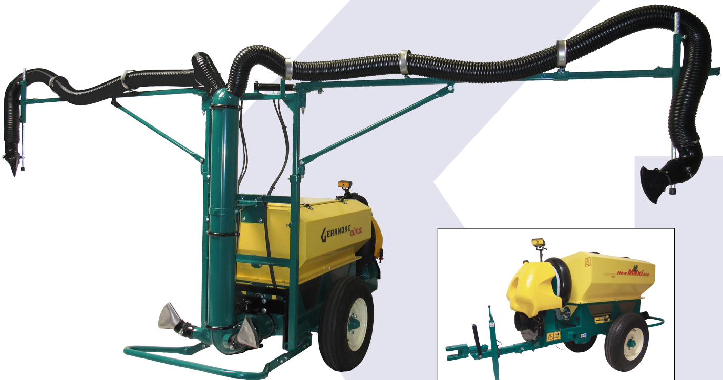
Shown with optional 2 row boom