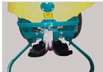
Variable speed hydraulic driven agitator & feed system